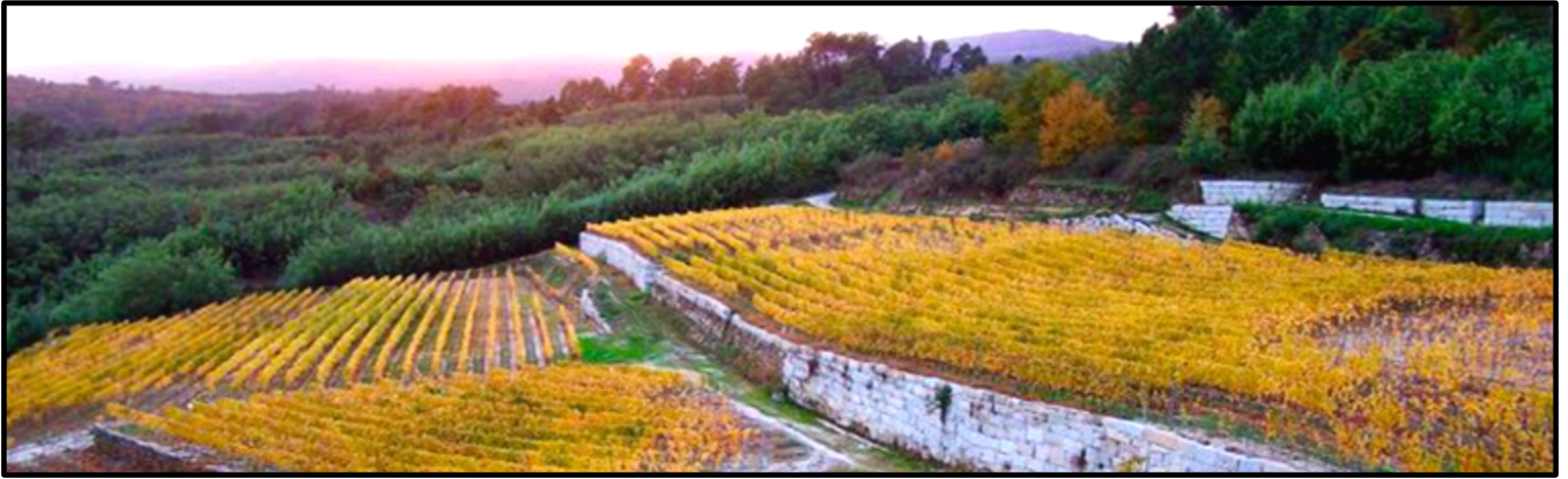
Casal de Armán Terraced Vineyards